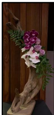
Ohio – Orchid