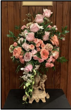
Delaware - Rose