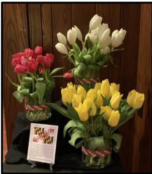
Maryland - Tulip