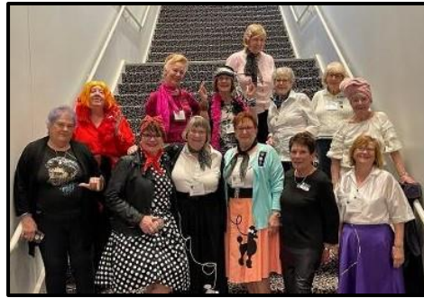
GCFP Board Members Dressed for Rock 'n' Roll Flower Show