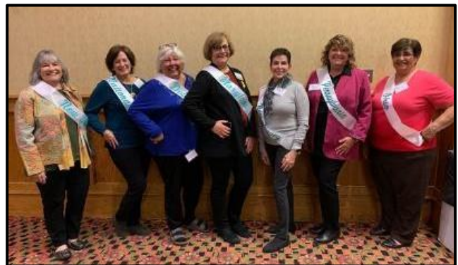
CAR-SGC Presidents at the November Conference