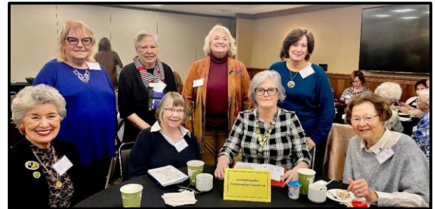
Environmental Conservation Concerns