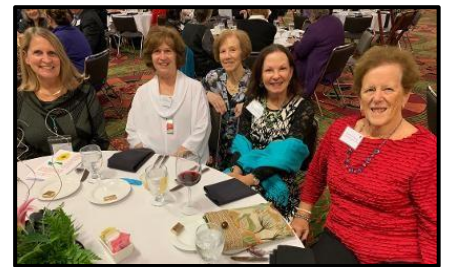
From National Capital Area