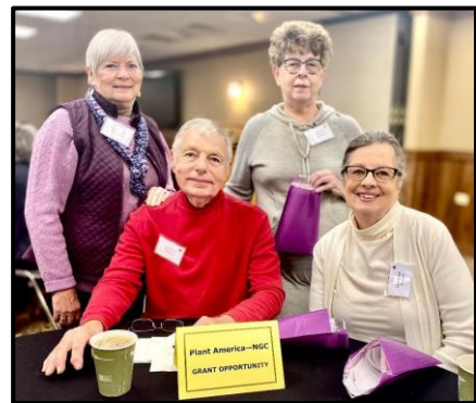
Plant America - NGC Grant Opportunity