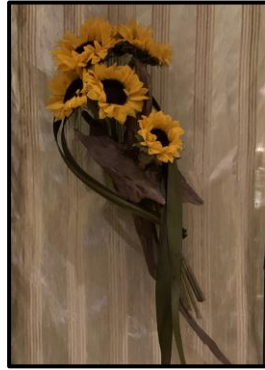
Sunflower – New York