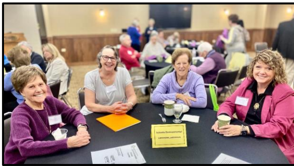
Schools Environmental, Gardening, Landscape