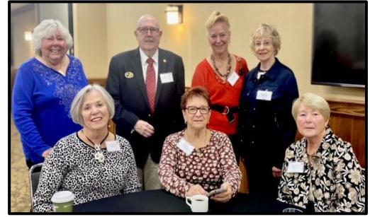
Container and Indoor Gardening