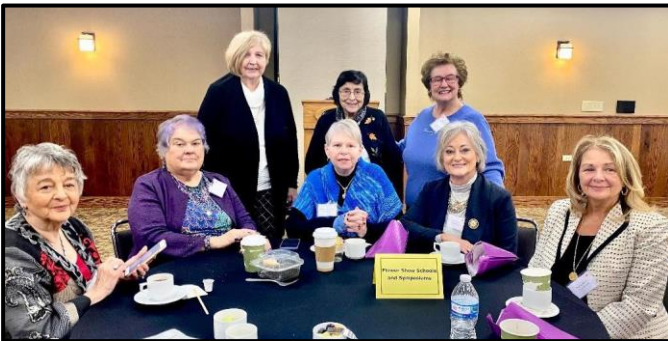
Flower Show Schools