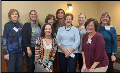
From National Capital Area