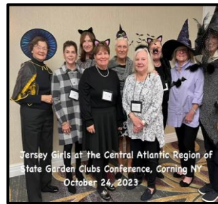
Jersey Girls at the CAR-SGC Conference in Corning, NY October 24, 2023

While gearing up for the colder months ahead, I’ve enjoyed visiting numerous clubs at their recent holiday fundraisers, luncheons, flower shows, house tours, shopping sprees, and programs. I particularly enjoyed the interesting presentations on topics ranging from Growing Topiaries to Pollinator Pathways to Floral Arranging for Holiday Entertaining, not to mention, fabulous vendors and silent auction / raffle items offered a wide variety for gift giving.