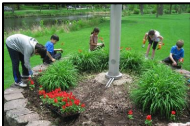
Demarest Garden Club hosts its Annual 5 th Grade Planting Day... a very "healthy" project

Lastly, it is also a busy time for our Awards and Scholarship Committees. They have been promoting and reviewing the wide range of offerings for students and clubs. NJ Youth Clubs are currently focused on NGC's Poster, Poetry and Sculpture Contests while our Garden Clubs are submitting applications for a wide range of awards, including the GCNJ President's Project "Plant America - Gardening for a Healthy Mind, Body and Soul".