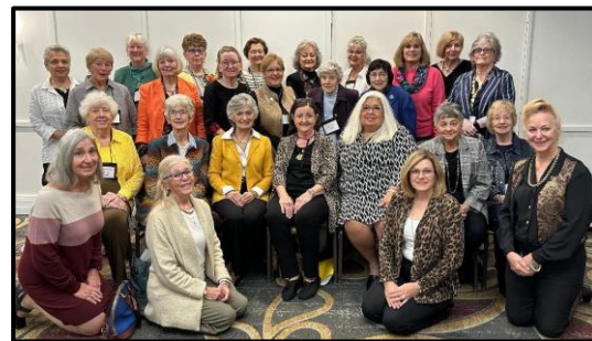
Attendees from Pennsylvania