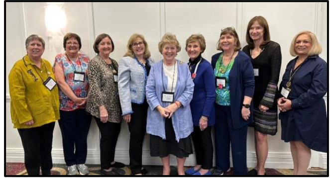
Our NGC President and our CAR-SGC Region Director with our state Presidents