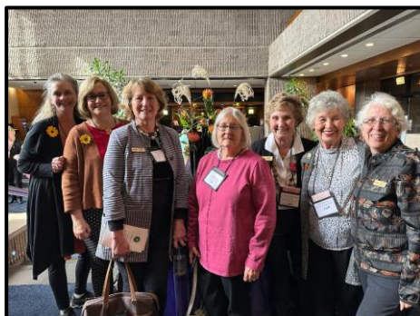
Group from Maryland At CAR Conference