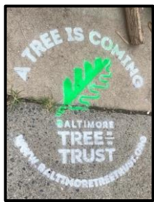
Sidewalk images in Marble Hill neighborhood of Baltimore