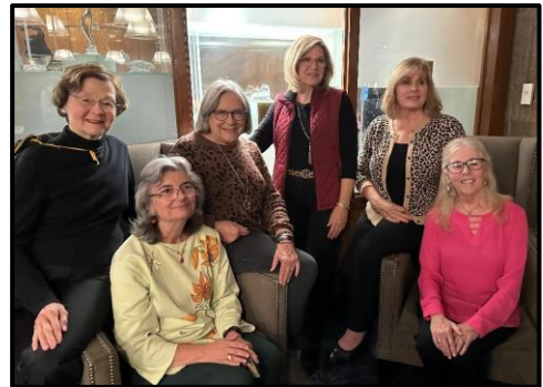
Group from New Jersey