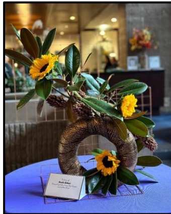
National Capital Area