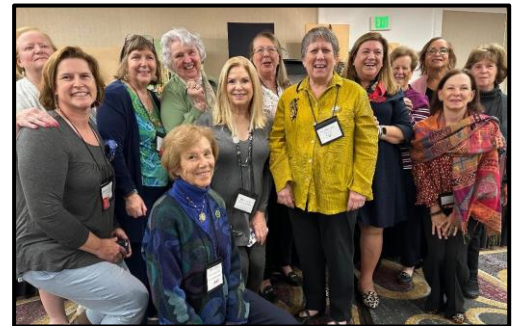
From the National Capita Area