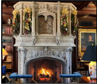
Drumthwacket beautifully decorated for the holidays by GCNJ's local garden clubs

Drumthwacket to marvel at the beauty and creativity expressed by these very special garden clubs whose members so generously share their talent and time with fellow New Jerseyans who visit during the holidays.