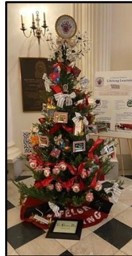
Montgomery County: "A Natural Home to Lifelong Learning" by The Garden Party Garden Club

Resources, District V was able to purchase trees at a discount allowing them to plant in three locations.