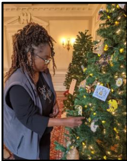
Bee Themed Tree