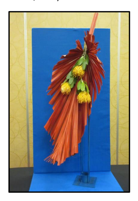
Superman creators were from Cleveland