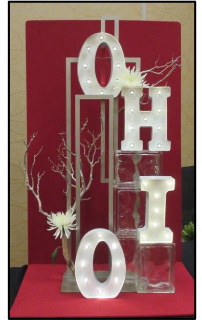
The Ohio State University