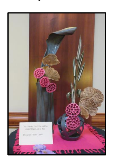
National Capital Area Garden Clubs