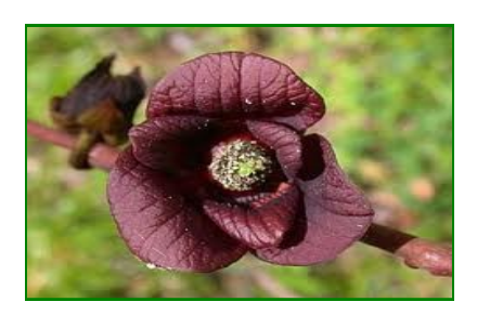
Flower of Paw Paw

Gotti Kelley Improved Cultivars/Trees cryptomera@aol.com