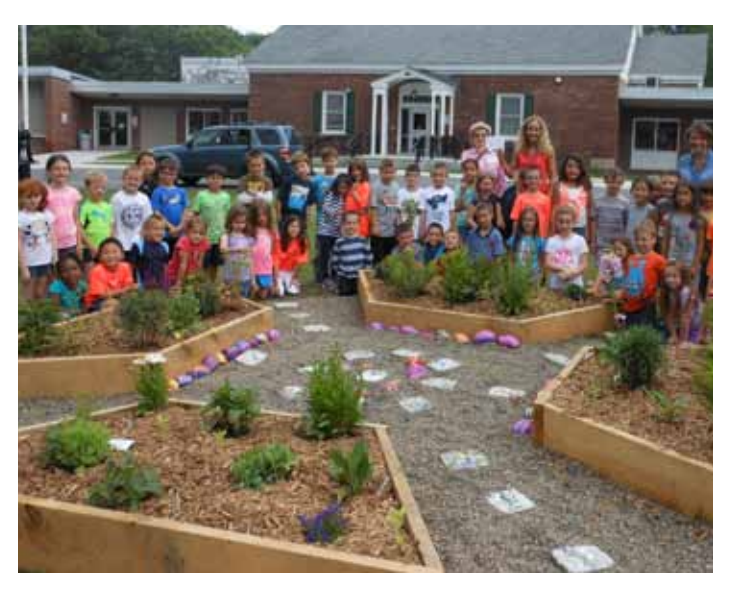
The students at the Bell Top Elementary School in their garden that the Greenbush Garden Club supports with gardening programs.