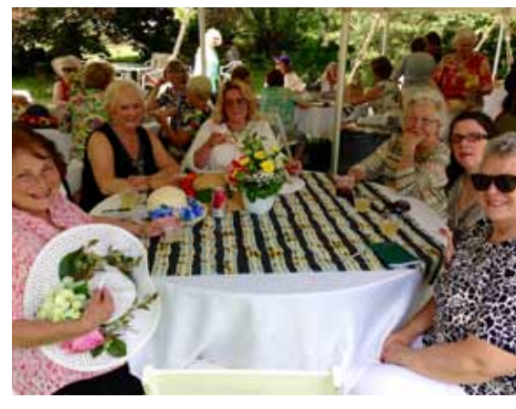
MAKING FRIENDS! Tea in Kinderhook, members from Hugh Plat and Western Hills garden clubs.

Our garden club doesn't meet in July and August, but we are already looking forward to decorating the Schenectady County Historical Society building for their Fall Walk-About.