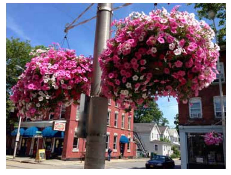
An example of the baskets that are planted by the club and are affixed to more than 20 lampposts throughout the business district in Beacon, NY.

The club also has a garden that they maintain at the Washington Monument triangle on Wolcott and Teller Avenues in Beacon. Members weed the garden and trim the shrubs so that it looks its best for visitors and for the residents of this community.