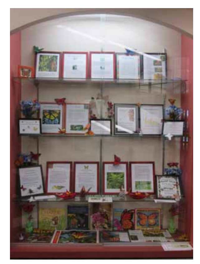
The club's display about the Monarch Butterfly at the East Greenbush Library.

The garden the club maintains at Fort Crailo Historic Site was included on the Rensselaer County Cooperative Extension Garden Tour on July 9th. Despite the rainy weather, the tour was very well attended and we received many compliments on how the club has refurbished and maintained the garden.