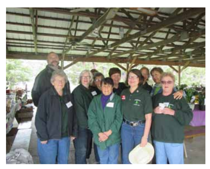
Members at the very successful annual plant sale held in May.