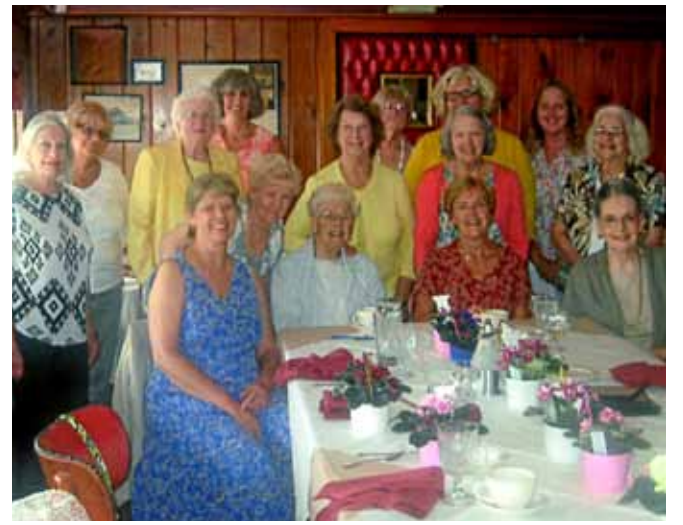
The Coxsackie Garden Club in Greene County celebrated their 60th Anniversary with a luncheon at Red's Seafood Restaurant in Coxsackie. I was honored to be part of it.

First, the Fall State Meeting at the Grand Hotel in Poughkeepsie, NY will be held September 28 and 29, 2015. A State Meeting in our District, basically in "our backyard" for you to enjoy wonderful speakers, a yummy lunch, meet and/or rekindle new/old friends and just have FUN! Shopping, too, will be available from vendors. If you haven't received a flyer for this meeting, check the State website to download it, review, complete, write a check, mail, and mark your calendar. It might be a good idea to call your colleagues/friends and remind them to join you! The registration flier is included at the end of this newsletter. ( cont. on pg 2 )