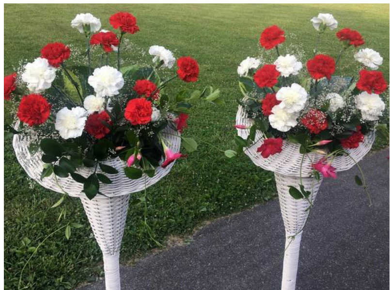
Floral decorations for the Germantown High School Graduation provided by the club.