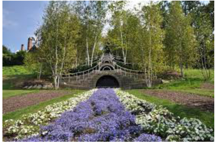
The Blue Steps at Naumkeag.

Our Old Fashion Sunday, at the Pruiyn House, is slated for September 7, 2021 from 2– 4 pm. There will be many vendors, and many different foods will be available. The Blue Creek Garden Club will have fall arrangements and other floral things for sale along with a White Elephant table. All are invited to join us. It has always been a wonderful day.