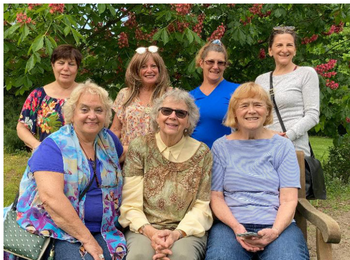
New Paltz Garden Club members at the Orange County Arboretum.

For September, we will return to Mohonk for an anticipated garden and greenhouse tour. In October, we are planning a field trip and possible workshop at a local garden center and shop. And in November we will be offering our Holiday Craft workshop and we hope for a December Holiday Party.