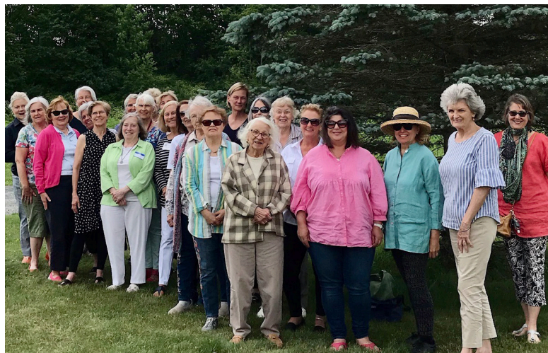
The club's first meeting of 2021 was held on June 15 at Volunteer Park in Valatie.