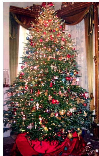
Above: Renee Benenati's incredible Christmas tree.