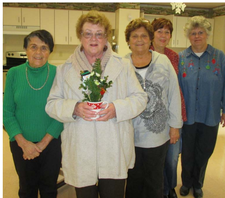
Above: The club’s American Legion Garden got a new flag pole.