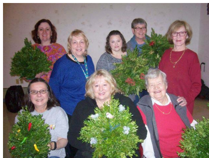
Left: Club members with their arrangements at the club's Annual Boxwood Workshop.

Prizes were awarded. This was a fun event. Winners received bottles of wine and candy. Chocolate candy valentines were given to everyone else participating.