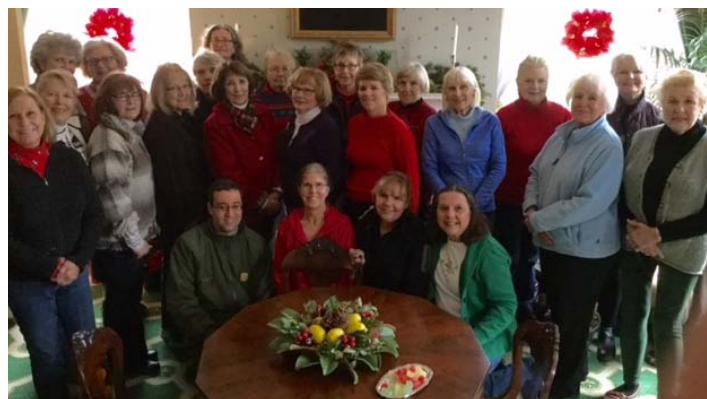
Below: Members and park service staff at Lindenwald.