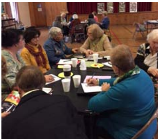
Our November Skills Workshop was a very informative exercise. We learned about Flower Show Schedules, Yearbooks, Awards, and Pressbooks.