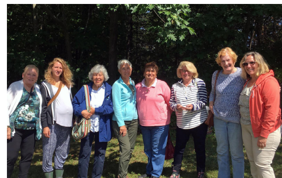
Top: Greenport Garden Club's display 'Autumn in the Country' at the Columbia County Fair.