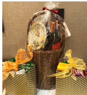
Top Left: Centerpieces and champagne cork key chain favors.