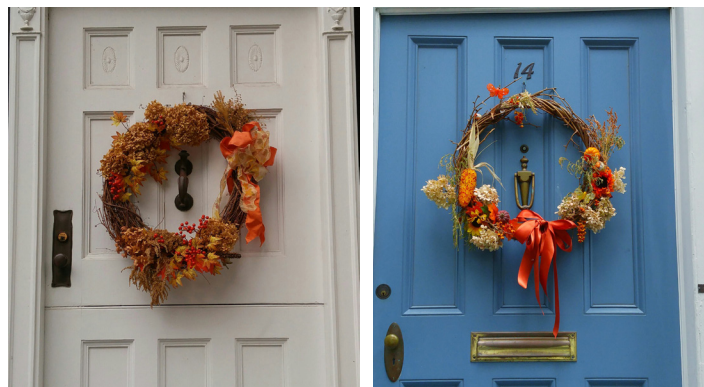
The front doors of the two buildings the club decorated for the Historical Society.

Of course, our December 15th meeting will be our Christmas party. We also plan to support the Guilderland Garden Club's fantastic fundraiser at the Mynderse Fredricks House in Guilderland Center.