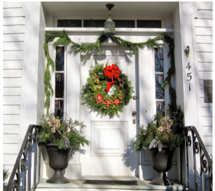
The Guilderland Garden Club is busy getting ready for the Annual Open House and Greens Show at the Mynderse-Frederick House at 451 Main Street, Route 146 West in Guilderland Center.