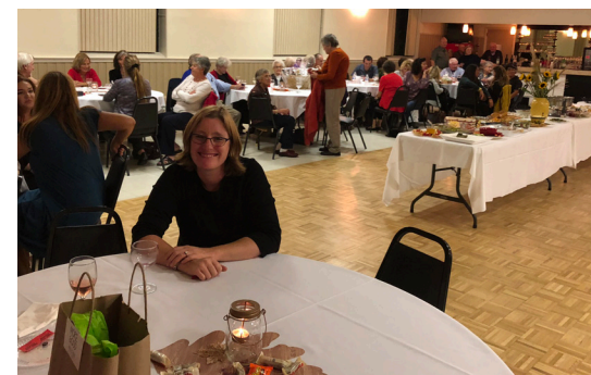
Top: Members enjoying a guided tour of Stonecrop Gardens in Cold Spring. Bottom: Club members, guests, and friends of the Tioronda Garden Club enjoy a night out at the club's annual Autumn Wine Festival.