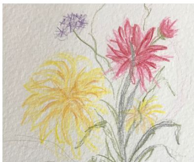
Left: A Posey Postcard created at the 'Posey, Painting, Postcard' workshop.