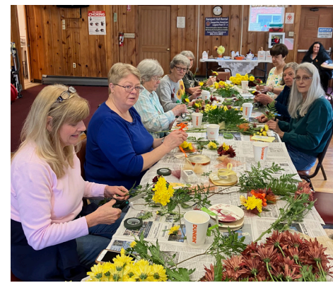
Left: Celebrating 100 years.