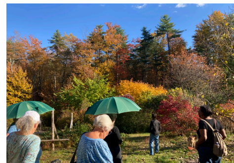
Members visiting Mohonk and the Hortus Arboretum.