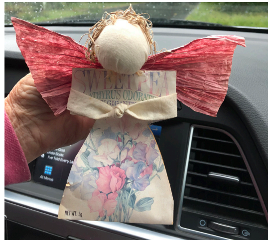
This year the club will be decorating their tree with a seed packet angel for the Festival of Trees.

The finale for our garden club is our annual Holiday Luncheon, held on December 4, 2024 in Schoharie. All members participate and it is a much loved event.