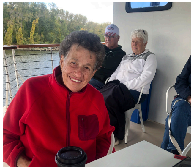
Top: Visiting the Pruyn House's Beautiful gardens. Above and Left: Celebrating our 60th anniversary on Dutch apple Cruise. A very windy chilly day!