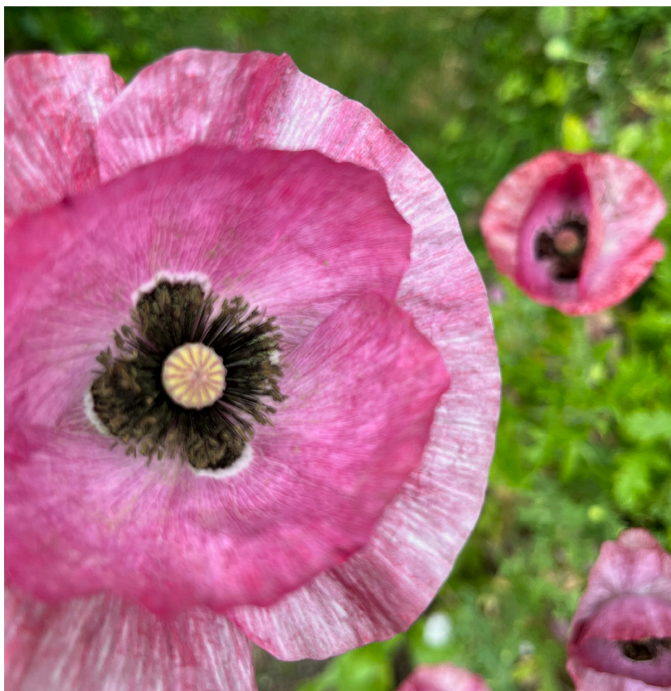
Beautiful poppies at Stone Crop Garden in Cold Spring, NY.

The Digest Online is published quarterly in February, May, August, and November. Deadlines for submissions are the 15th of the month before each issue (January, April, July, and October). The February Digest only features the Spring District Meeting.