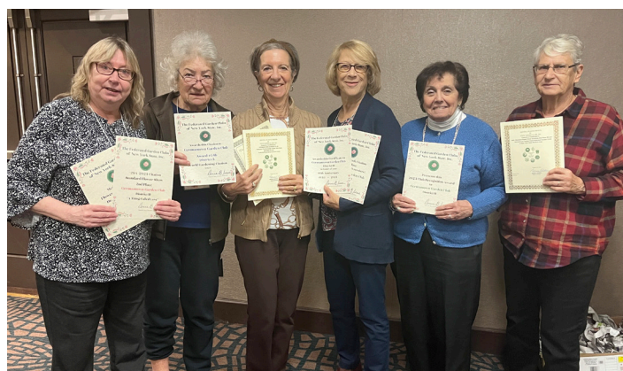
Above: The club’s Flower Show “The Four Seasons.”