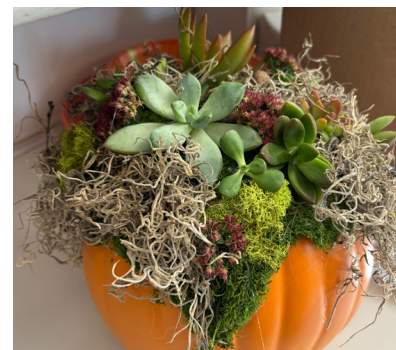
Members created arrangements in pumpkins.